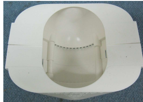
In-ceiling Technologies type IGLOO Downlight Barrier