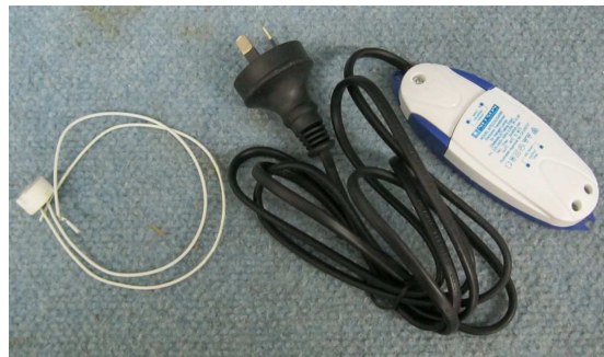
In-ceiling Technologies type IGLOO Downlight Barrier – Test Ballast and downlight End of the Test report